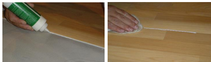
Beauflor Seam Bond application and clean up with a damp cloth