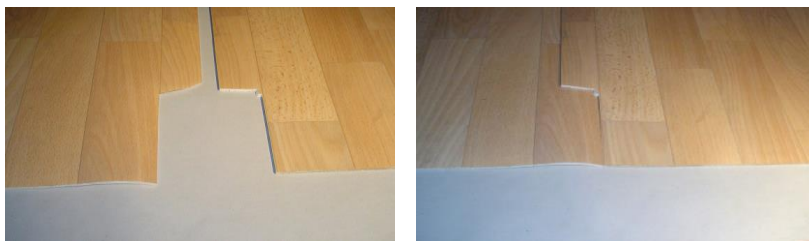
Cutout windows at the seam to align pattern